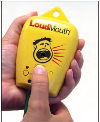
Swith the unit "ON". The green light should be lit.

6. Press the TEST button to simulate a damage condition before beginning work and anytime during installation if desired to confirm LoudMouth operation.