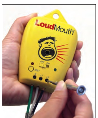
Connect the leads to the LoudMouth.